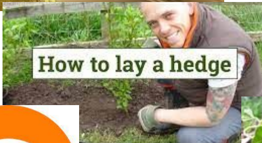
How to lay a hedge

There are plenty of things on our goal list, we will solidify our concrete and aspirational goals soon... ...but we need more members!