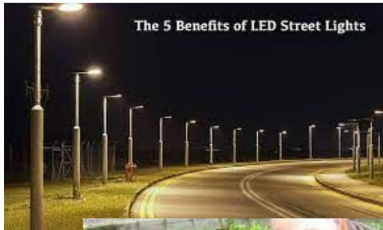
The 5 Benefits of LED Street Lights

There are plenty of things on our goal list, we will solidify our concrete and aspirational goals soon... ...but we need more members!